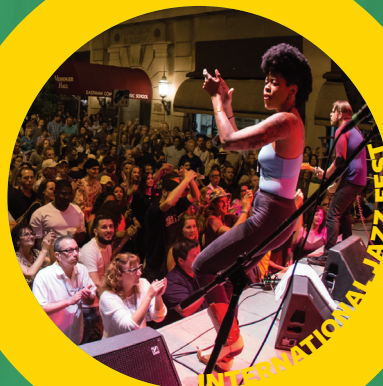
INTERNATIONAL JAZZ FEST