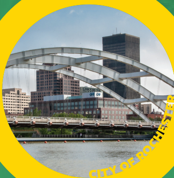
CITY OF ROCHESTER