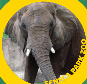
SENECA PARK ZOO

*Benefit packages vary by job title, union and employee group. Benefits are subject to change based on rule, law, collective bargaining and budgetary constraints. This summary should not be construed as a binding promises of coverage or guarantee of benefits continuation.